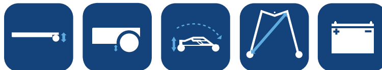
Height of legs ▼ Ground clearance ▼ Height when folded ▼ Turning diameter ▼ *Working ability ▼